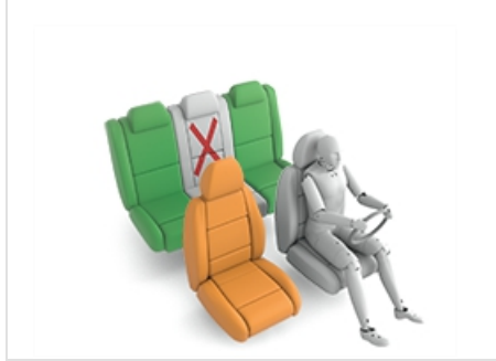
Maxi Cosi Cabriofix & EasyBase2 (Belt)