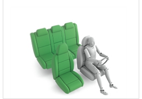
Römer King II LS (Belt)